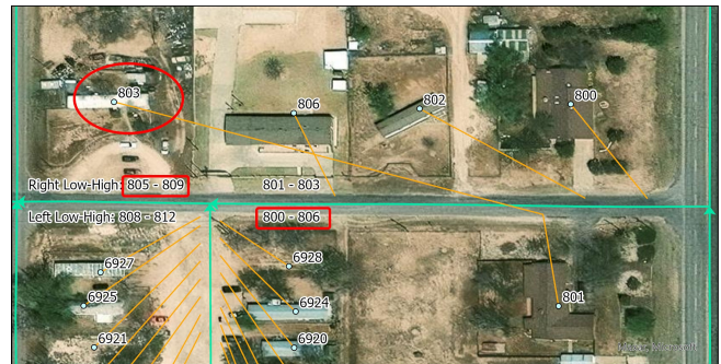
Example: Fishbone Lines - Correct (Left); Fishbone Lines - Error, due to incorrect street address range (Right)